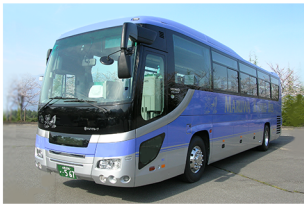
Free shuttle bus

[Departs from] After exiting the station by the stairs/lift, turn left. Buses depart from the furthest bus stop ahead, on scheduled timings.